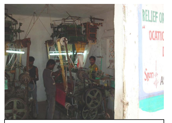
Trainees testing their hands on powerloom