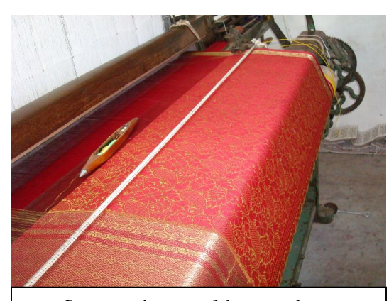
Saree coming out of the powerloom