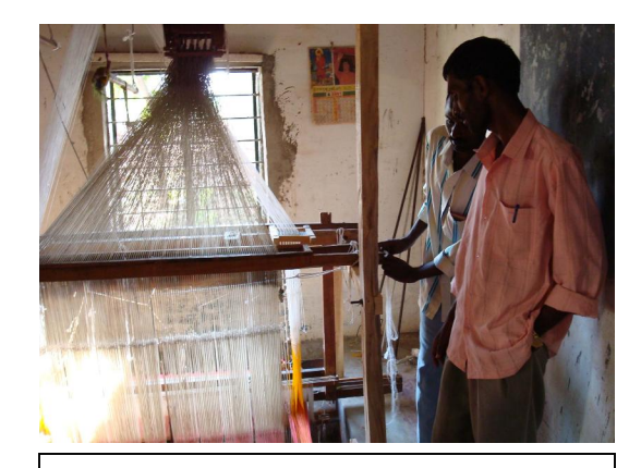
Training on handloom