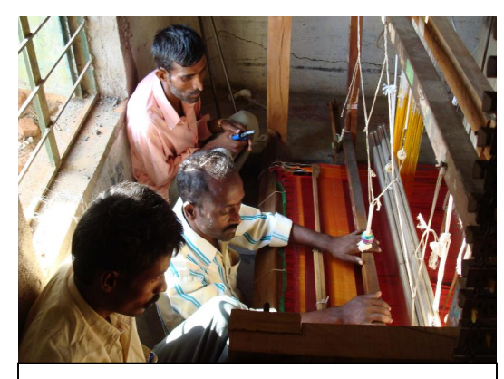
Trainees testing their hands on handloom