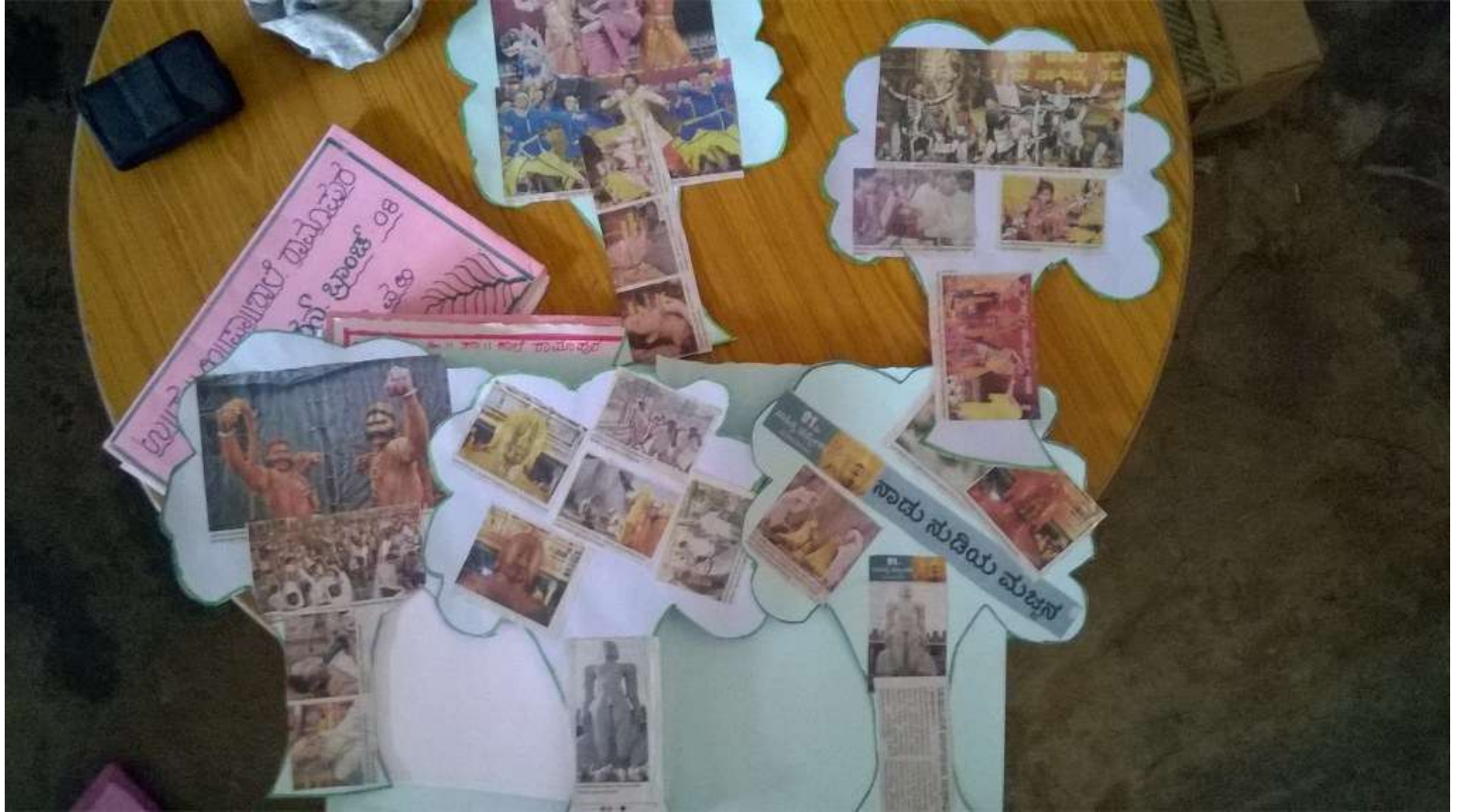
Art work by students of HPS Ramapura