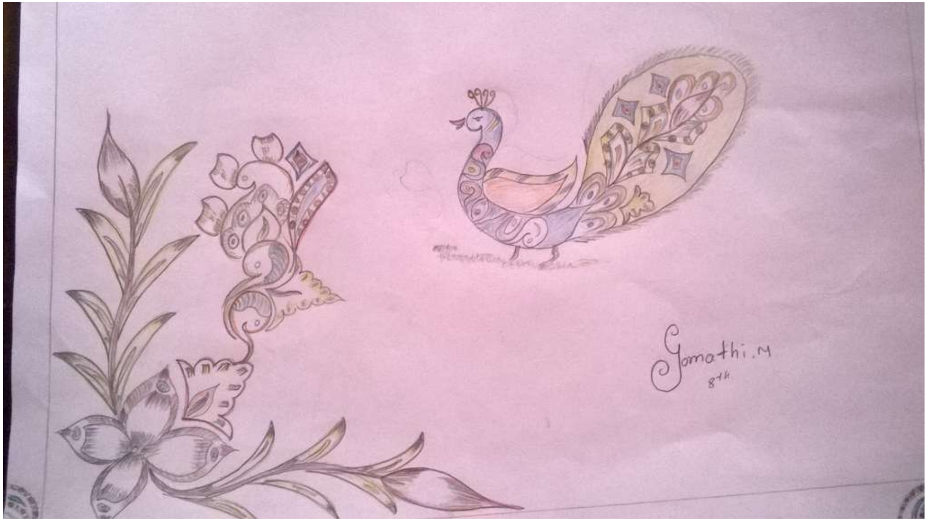
Art work done by students of HPS Kempana Hatti