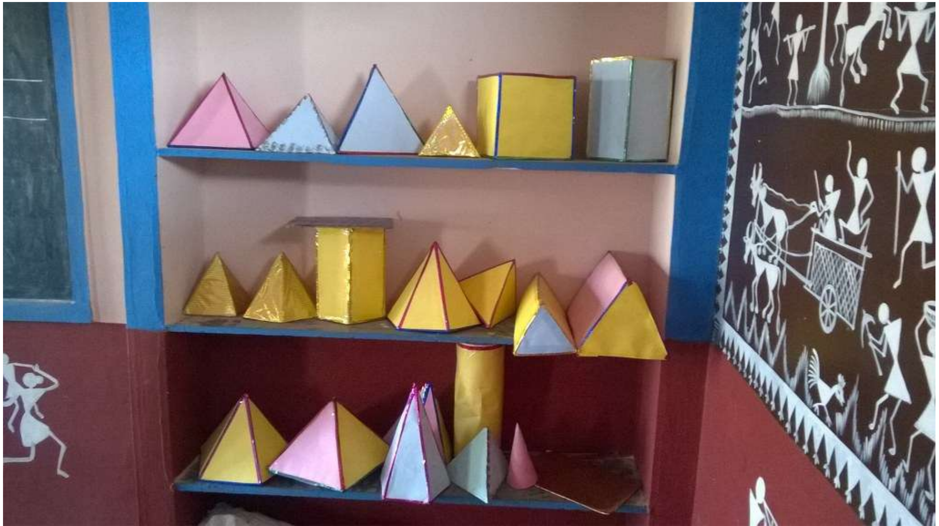
Model Prepared at HPS- Mangala