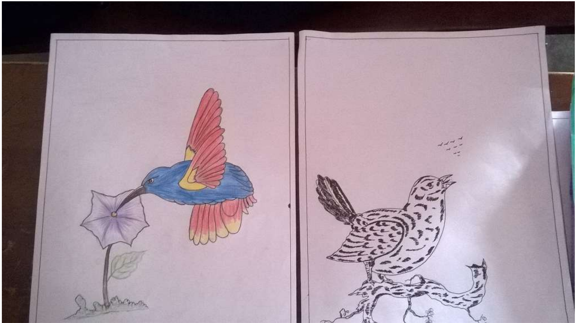
Art work done by students of HPS Kempana Hatti