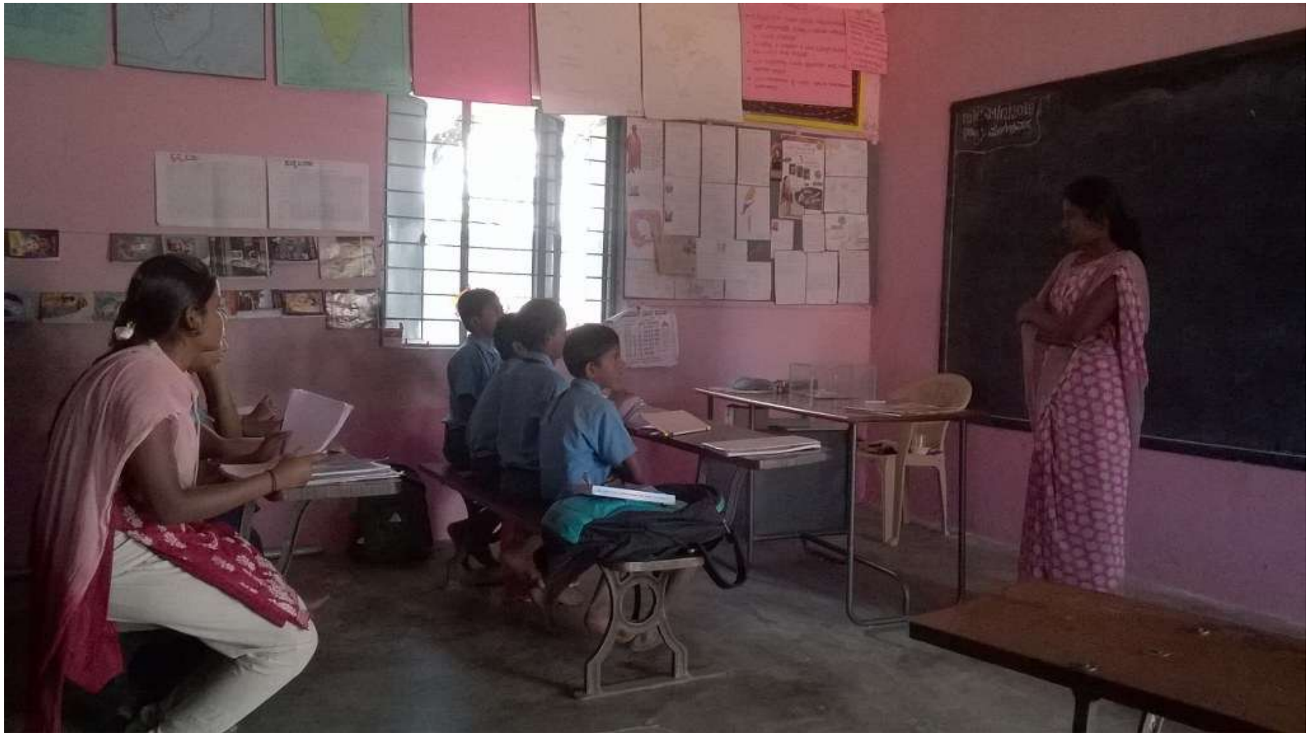
Science Class at HPS Kempana Hatti.