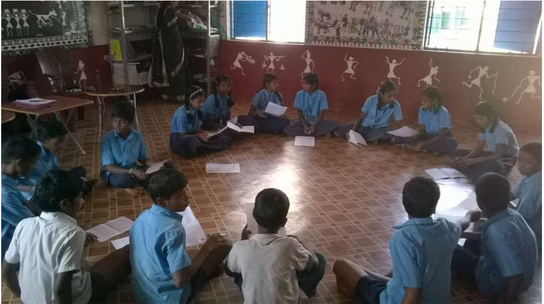
Same as above.