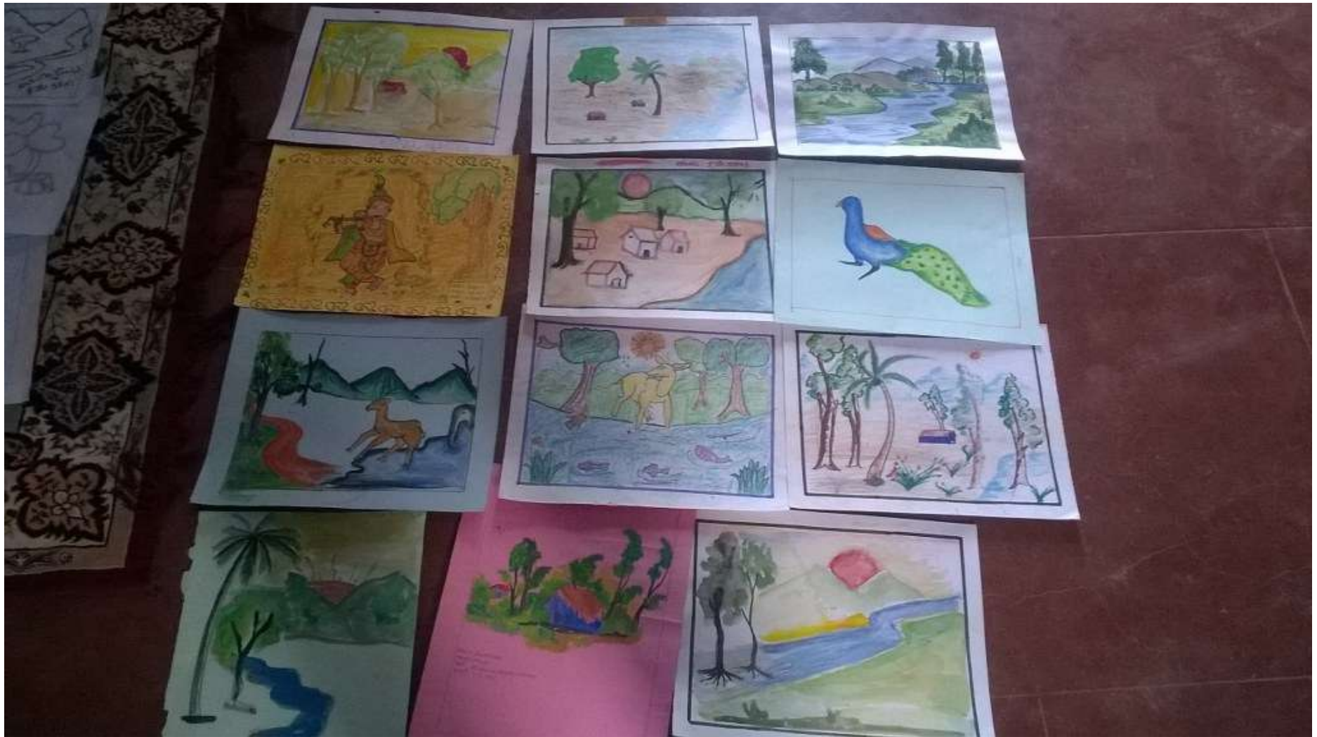
Art work of students of – HPS Hannur.