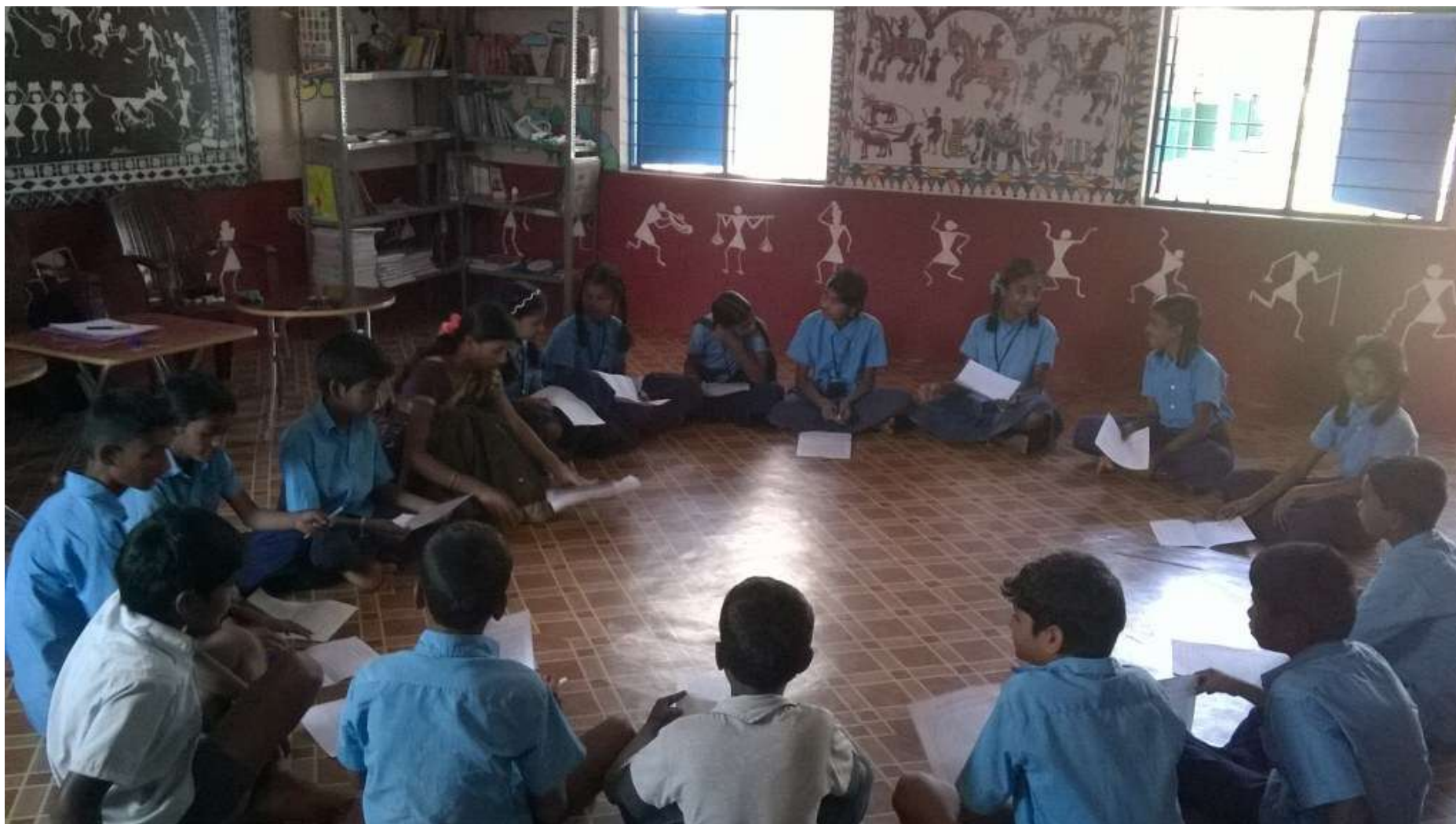
"Book of the month" activity in progress at HPS- Mangala