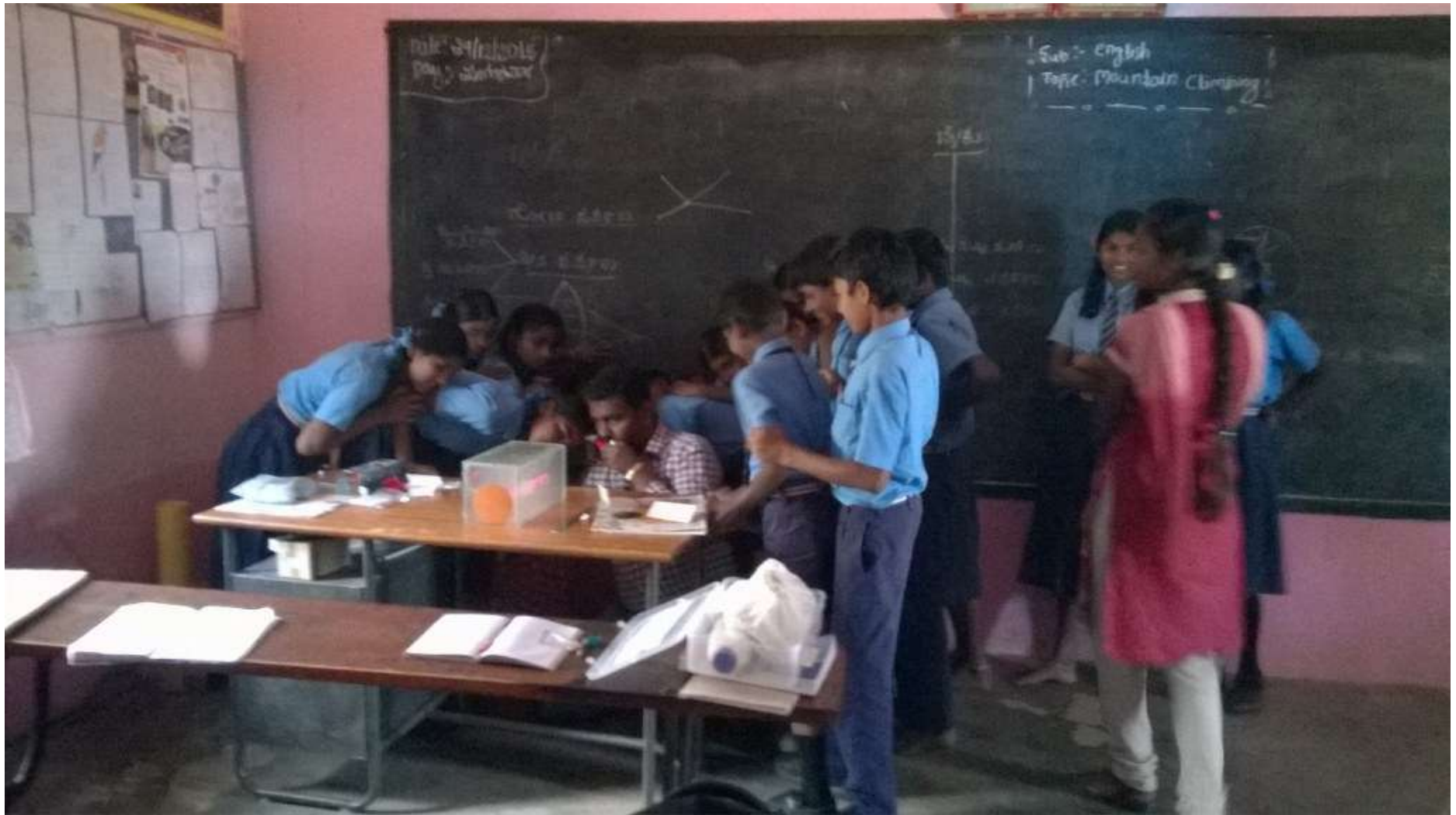
Science experiment at HPS Kempna Hatti.