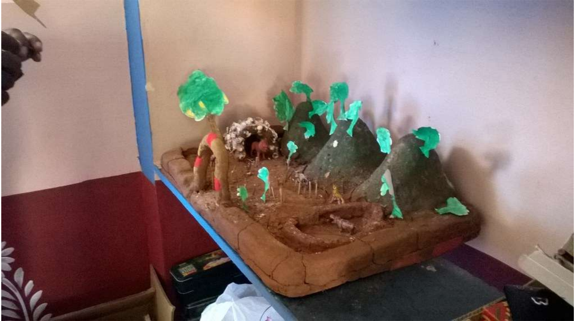
Model Prepared at HPS- Mangala