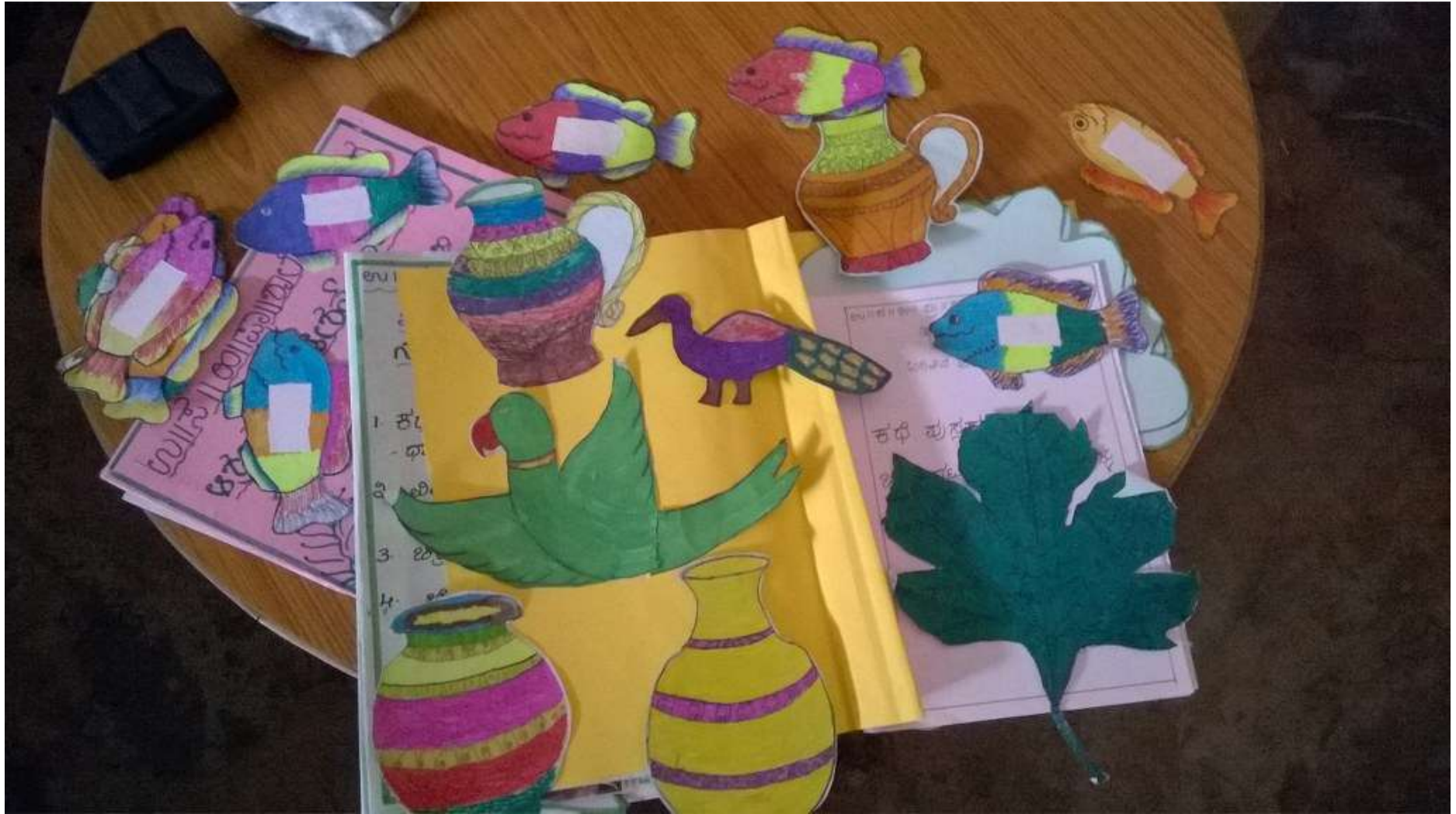
Art work by students of HPS Ramapura